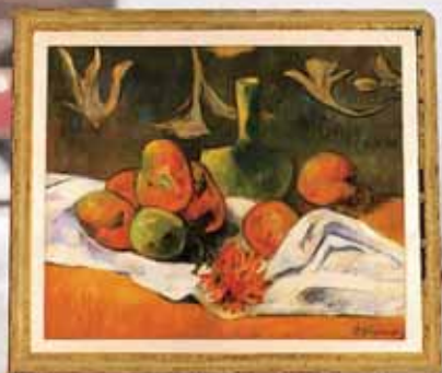
· EinScan H2 Scanned Data