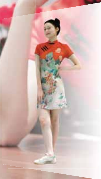
· EinScan H2 Scanned Data