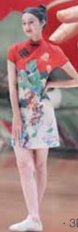
· 3D Printed Figure