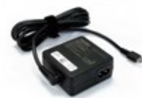
Dynabook 65W USB Type-C PD 3.0 AC Adaptor (PA5352E-1AC3)