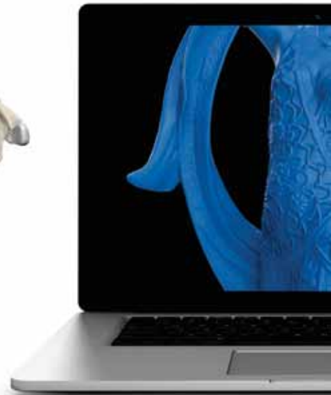
Handheld HD Scan Mode